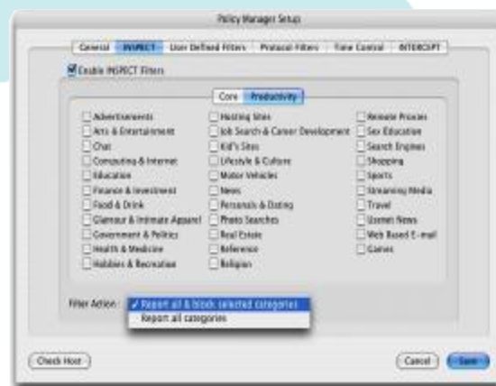
InterGate Inspect Productivity Categories