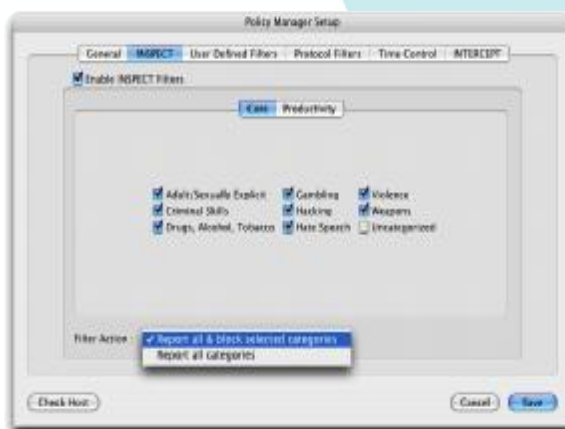
InterGate Inspect Core Categories